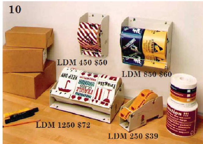
10. LDM -Convenient, Easy to use, Durable, and Economical are a few of the words used to describe our economy line of manual dispensers, the LDM series. 6.5" Max roll Dia. 3" Core adapters available $2.00 LDM 250 2.5", LDM 450 4.5", LDM 850 8.5", and LDM 1250 12.5"

We dispense most labels without any difficulty. When using with Mylar, foil, acetate or very thin labels, try our sharp edge plate. We can provide other modifications, if necessary.