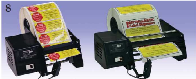
8. Dispensa-Matic "6-II, 10-II, and 16-II" - for roll or fan-fold labels to 5.5", 9.5", and 15.5" widths. Does not wind up waste, and loads VERY quickly. Best for large diameter rolls, and where constant speed is needed. (6" per second advance.) With Photo-eye "6-II" $704, "10-II" $774, "16-II" $834