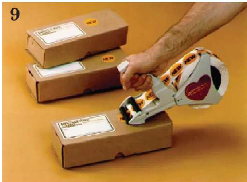
9. Scooter -Lightweight and inexpensive, handheld label applicator will save both time and labor applying labels on to the item in one motion. Die cut or butt cut, 1" or 3" core. Maximum roll diameter 4.75"