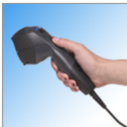
Scanner can be used as a portable hand-held device or.....