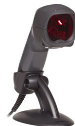
Scanner can be mounted using the adjustable stand.